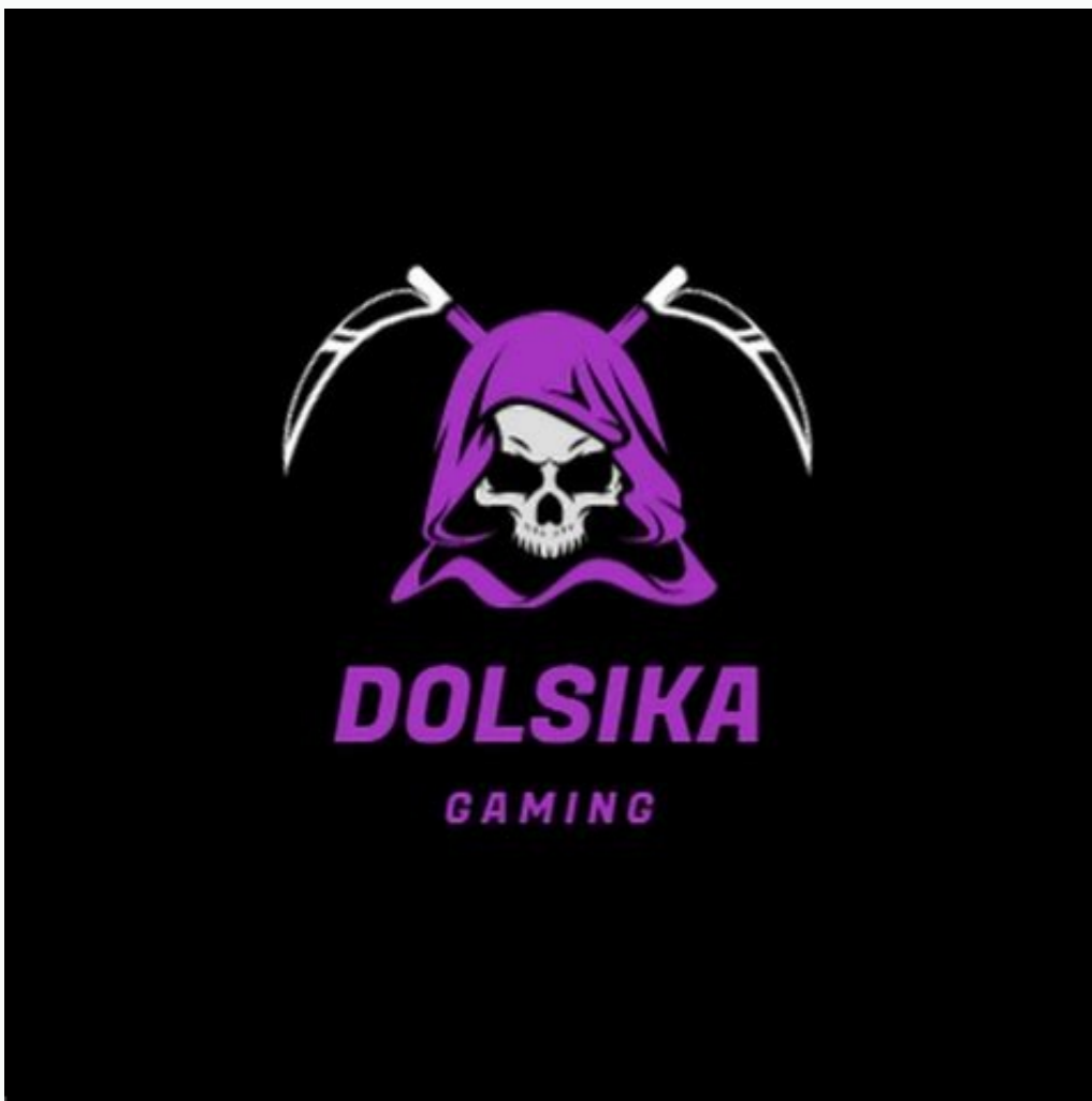
Game vip map hack ml. Vip empire map hack ml. How to get map hack in ml. Mlbb map hack vip. Vip map hack ml 2022. What is map hack in mobile legends. How to map hack ml.