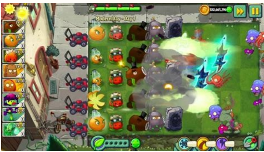
Plants vs zombie 3 pc. Plant vs zombie 2 new update.