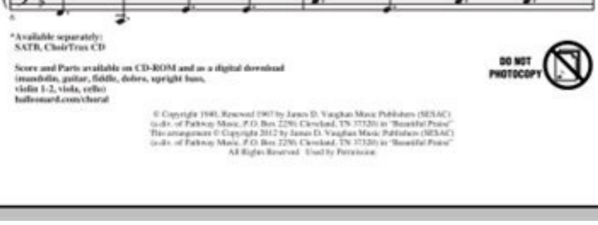
Gabriel's oboe organ sheet music pdf. Gabriel's oboe organ sheet music.