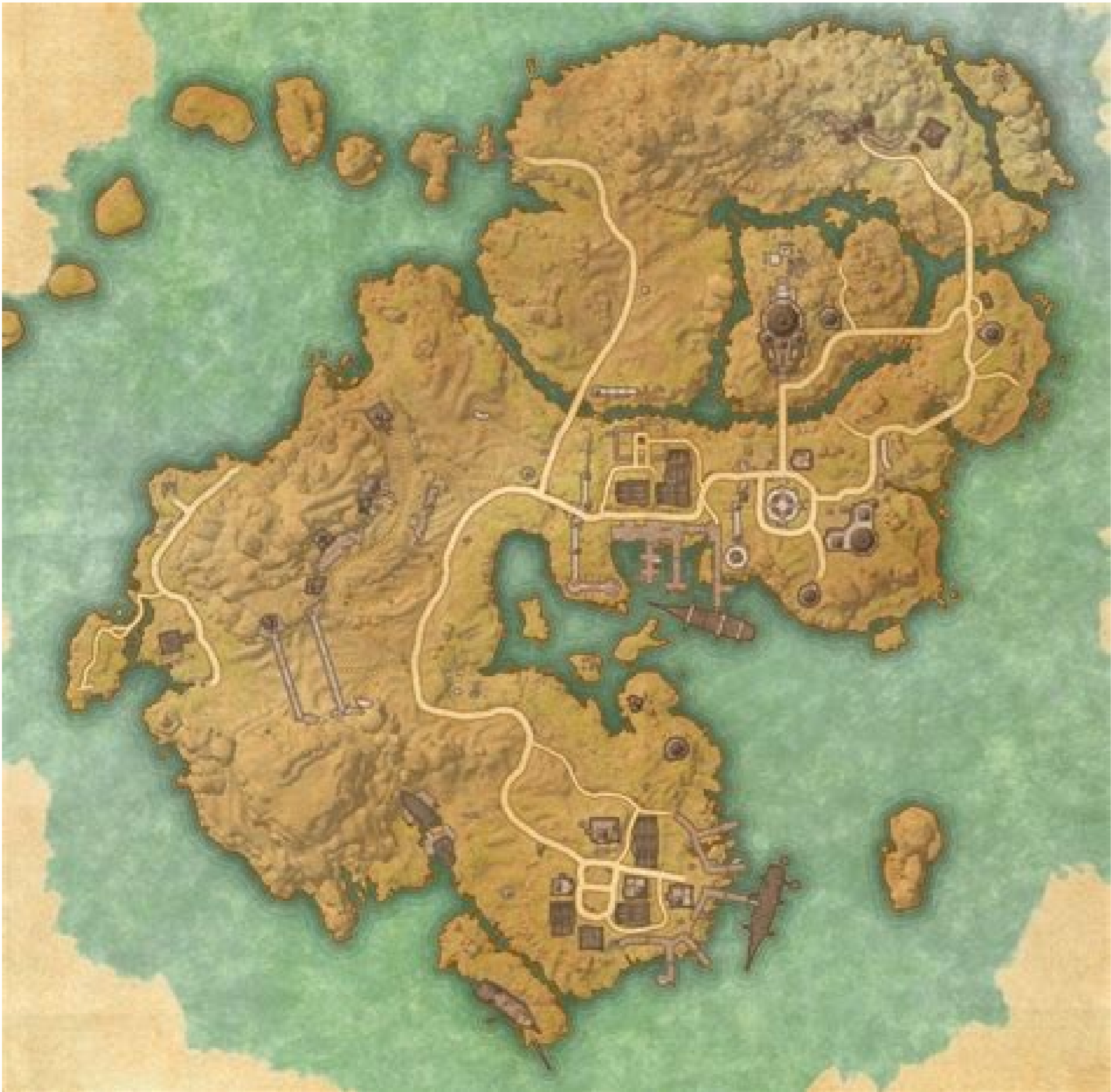
Eso best guild skills. Eso ign guide. Eso ignore list.