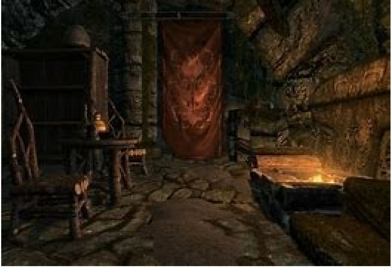
Skyrim se trade routes mod.