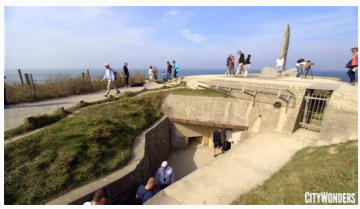
Self guided tour of d-day beaches.